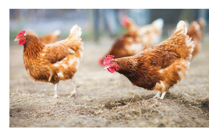
PROACTIV' POULTRY BX is incorporated into the feed of all poultry.

For more information, refer to the product's technical sheet.