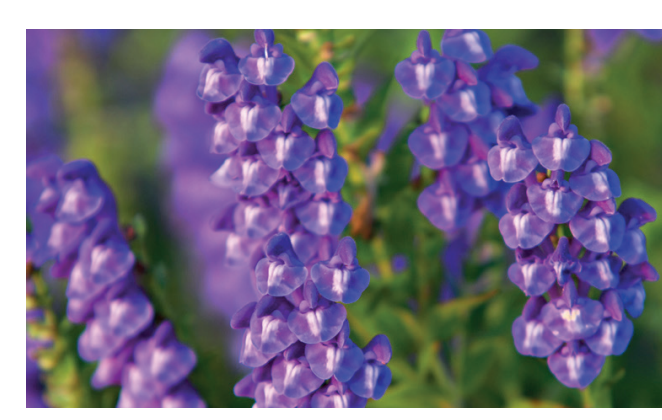
The beneficial effects of Scutellaria baïcalensis are recognized by a CCPA Group patent.

Incorporate in complete feed, at minima between the laying initiation and after peak of lay.