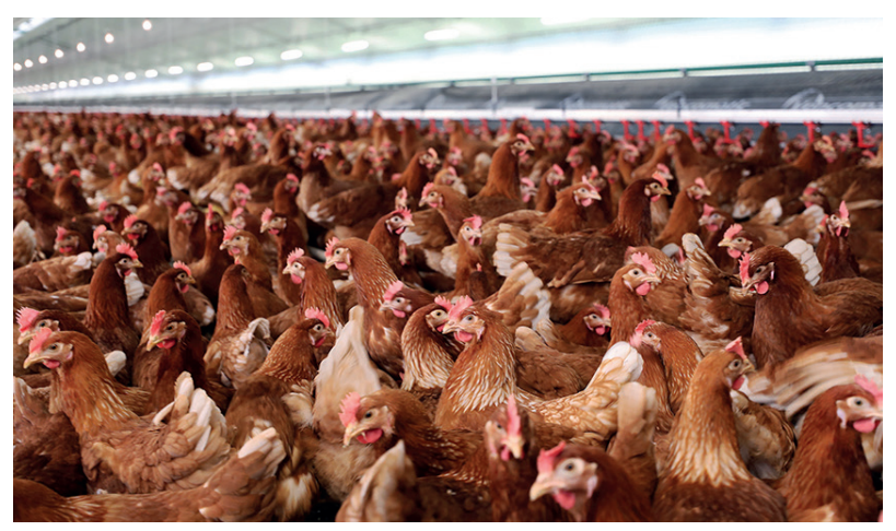
The numerous challenges in breeding can adversely affect laying performances.

Its synergetic association of curcuma with patented Scutellaria baïcalensis participates to the support of digestive organs. In the gut, Feedstim® Poultry contributes to a better intestinal integrity and nutrients absorption. It also participates to the good hepatic fonction. Feedstim® Poultry ensures the right nutrients allocation for lay.