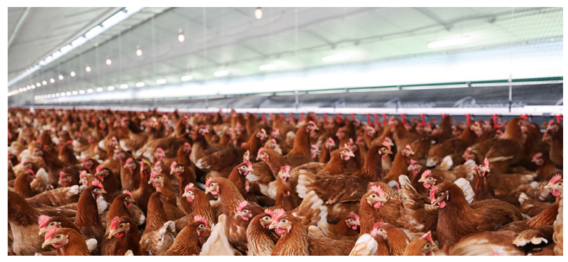
ProActiv'® Poultry contributes to digestive balance.

The result: better laying performance and improved animal comfort in laying and breeding animals.